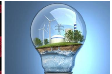
PROVIDING SUSTAINABLE ENERGY