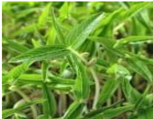
TRANSFORMING AGRICULTURE AND FOOD SECURITY

Harnessing Nanotechnology for Sustainable Development in Energy, Water, Health and Agriculture