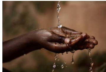
PROVIDING CLEAN WATER